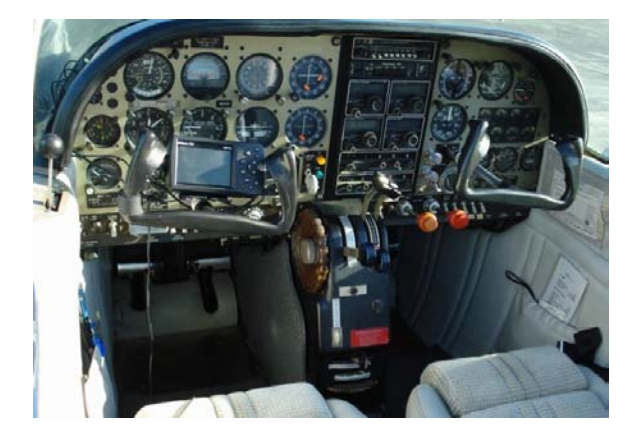
The main office of the D1. Here you can see the RH mixture verniers. Unique to this aircraft.. Not much bigger than a T-18!

I had just started Air Force pilot training and was really impressed with this beautiful airplane. I thought it would be fantastic to own one. Over the years, my interest in the Derringer continued. I read every article about its development and the attempts to put it into production. Whenever I saw a D-1 for sale, I would call if only to talk to someone who had one. I was really never in the market because they were too rare and too expensive.