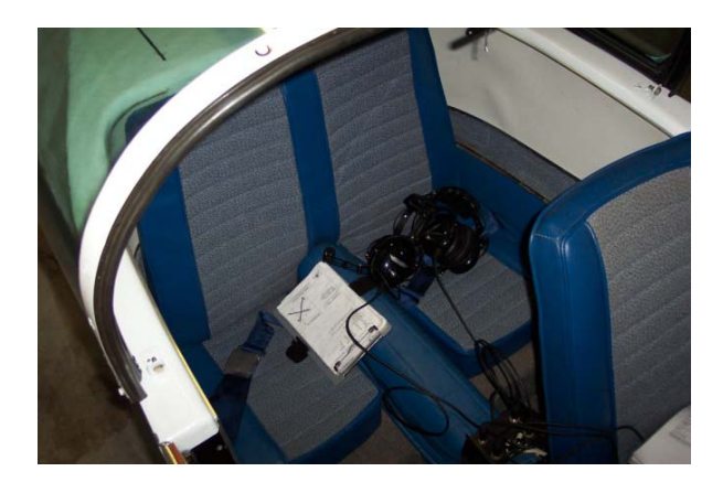
Look ma! 4 seats!