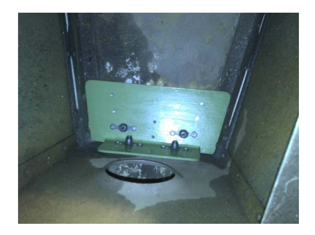
New 4130 Bracket in place

Once the bulkhead bottom was cleaned and filed and deemed without cracks, a 4130 bracket was fabricated with "longeron tabs" running transverse to and under the bottom of the rear bulkhead (see pic) - this 5 beer reasoning was that this would distribute the load (in this case more of a bending moment starting at the rear tail wheel bolt and running fore and aft) over a longer distance of the longerons.