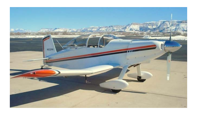
Fraser's new machine N633PM

Houston, Texas. After cleaning and minor upgrades at Walton Aviation and deliverance from Houston, the first order of business was installation of a new tail wheel.