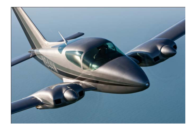
That's one good looking airplane!

Flying the D-1 is almost as much fun as meeting the people who want to know about it. Every time I fly it someone will say, "What is it?" or "I've never seen one." The reactions are always positive.