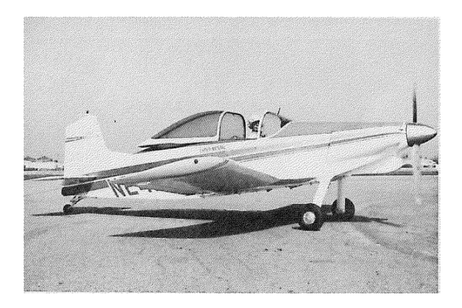
And now in her current state;

Interesting drawings sent to me by Bob MO of the 4 seat 180 HP T-18 (R-18) N249R. Here she is way back in 1975;