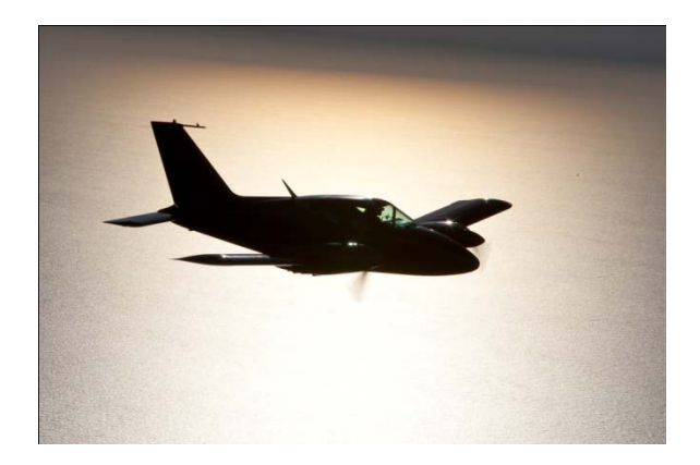
"If you have a T-18, you still need a Derringer"

After parking I realize what a fortunate person I am to be able to experience such a rare machine. I'm the caretaker of a piece of aeronautical history that few people have ever seen.