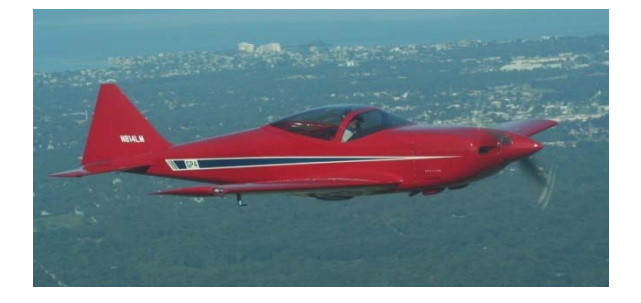
Les' new "retractable gear T-18" N814LM