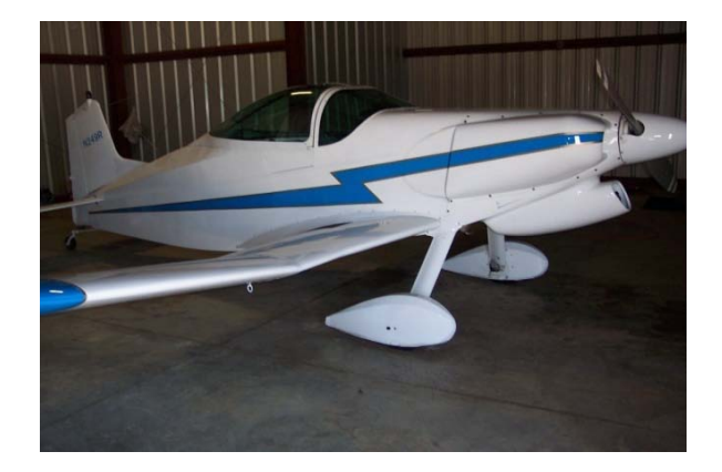
Not bad for a 35+ year-old huh guys?!